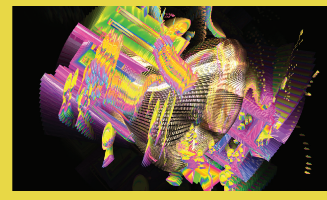
► UGLYKIKI The Release 無量 Dedicators, 2021 3D render. 1920×1080 px.