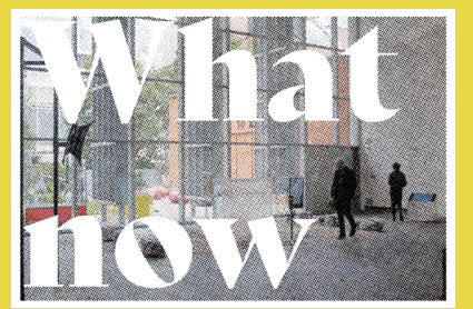
Mason Hershenow Untitled 3 (What Now), pigment print, 30×45 in.