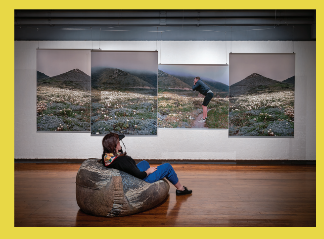
Alana Rios Superbloom, 2020 Hand-cut archival inkjet prints 54×180×18 in.

Cleia Dantas Recollection Series #5 , 1500×1125 pixels